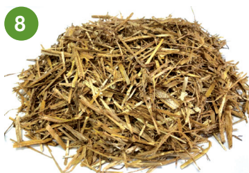
8 BARLEY STRAW - TWO TYPES 3.7% PROTEIN 5% PROTEIN