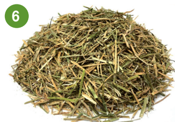
6 60% 2ND QUALITY ALFALFA AND 40% BARLEY STRAW 11% PROTEIN