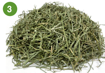
3 GREEN ALFALFA 17% PROTEIN