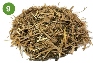
9 70% BARLEY STRAW 30% ALFALFA PELLETS 6.5% PROTEIN