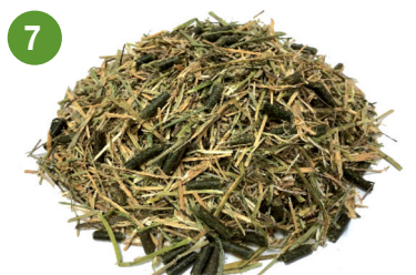
7 35% 2ND QUALITY ALFALFA 35% BARLEY STRAW 30% ALFALFA PELLETS 11% PROTEIN