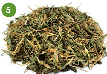
5 70% GREEN AND YELLOW ALFALFA 30% ALFALFA PELLETS 17% PROTEIN