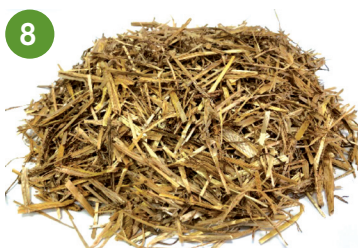
8 BARLEY STRAW - TWO TYPES 3.7% PROTEIN 5% PROTEIN