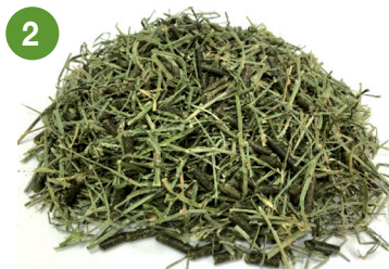
2 70% GREEN ALFALFA 30% ALFALFA PELLETS 17% PROTEIN