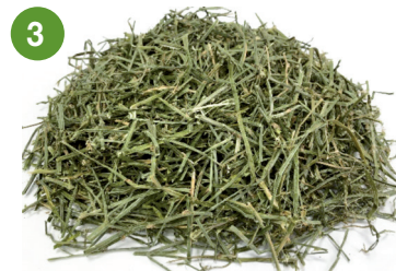
3 GREEN ALFALFA 17% PROTEIN