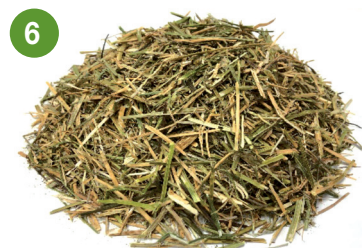
6 60% 2ND QUALITY ALFALFA AND 40% BARLEY STRAW 11% PROTEIN