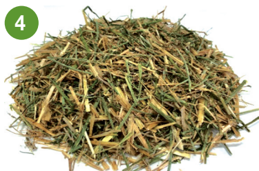
4 GREEN AND YELLOW ALFALFA 17% PROTEIN